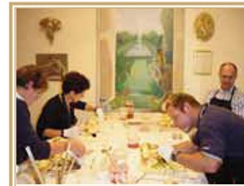
Master Gilding Class in progress

For more info visit www.artgilding.com.au